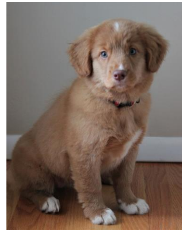
Ketch is three months old today!