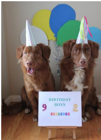
Vice, 2, left, and Channel, 9, right.

Pyrat, Reef, and Krill are showing this weekend at the Great Barrington Kennel Club event. We wish them the best of luck.